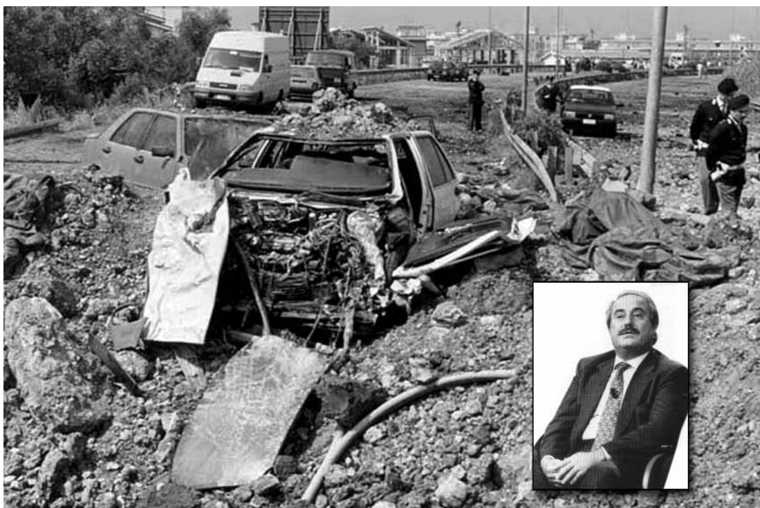
The assassination of the public prosecutor Giovanni Falcone, one of the most known and most committed Mafia investigators.

Vocabulary: distinction = Unterschied admission = Aufnahme